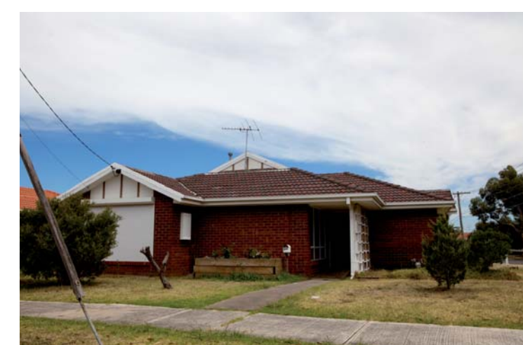
brick veneer finish houses